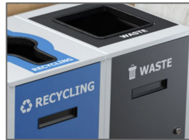
Lounge signage example

Increase in quality of recyclables recovered: 54% Less recyclables in trash: 18%