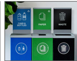
Spectrum signage example