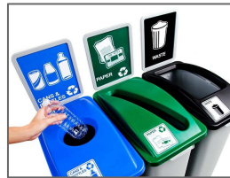
Simple Sort signage example