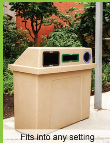
Fits into any setting