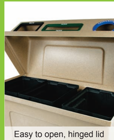
Easy to open, hinged lid