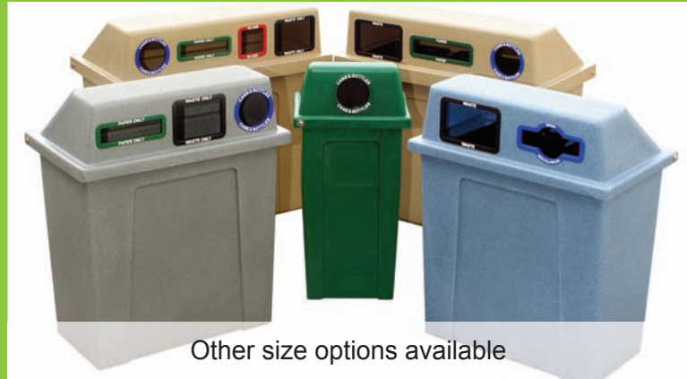
Other size options available