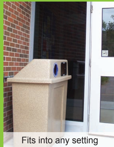
Fits into any setting