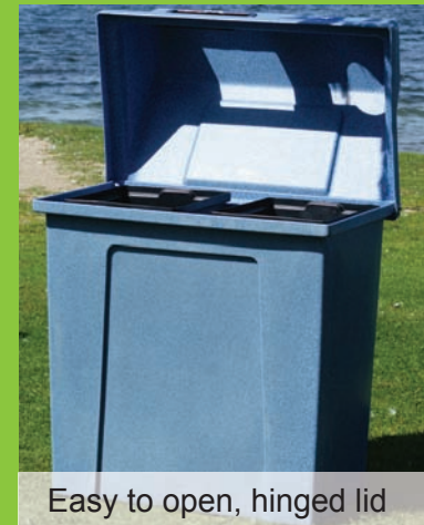
Easy to open, hinged lid