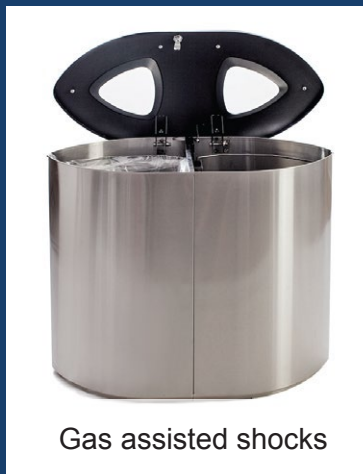
Gas assisted shocks