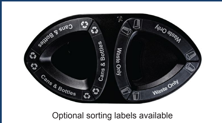
Optional sorting labels available