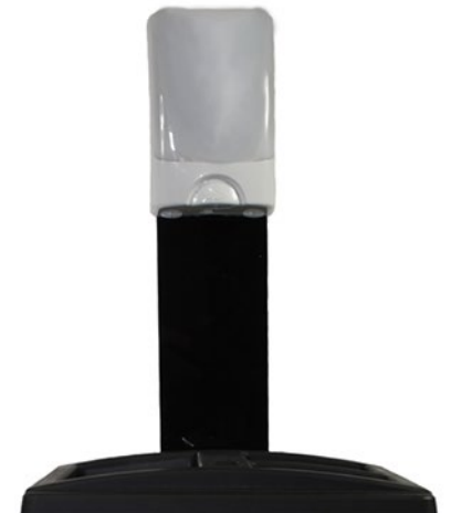
Optional Hand Sanitizer Mount Kit