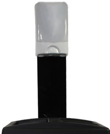
Optional Hand Sanitizer Mount Kit