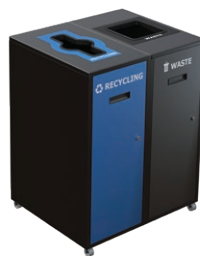
23 Gal Double