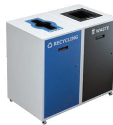
31 Gal Double