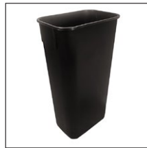
Plastic liners included