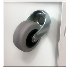
2" rubber casters