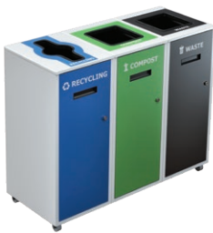
15 Gal Triple