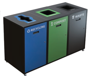
31 Gal Triple