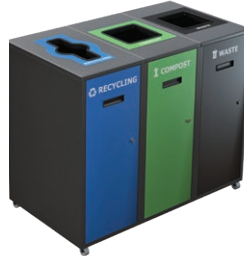
23 Gal Triple