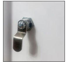
Door locks and keys included