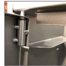
Stainless steel pivot-hinged doors