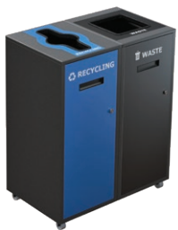
15 Gal Double