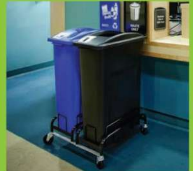
Optional Wheel Dollies