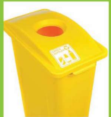
Custom colors available