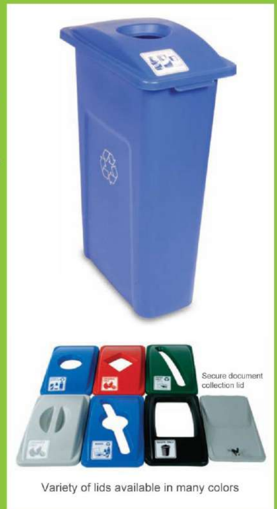
Variety of lids available in many colors