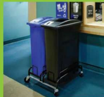
Optional Wheel Dollies