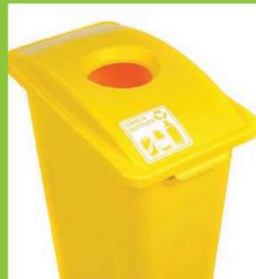
Custom colors available