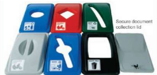
Variety of lids available in many colors