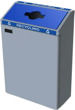
Shown without optional headerboard