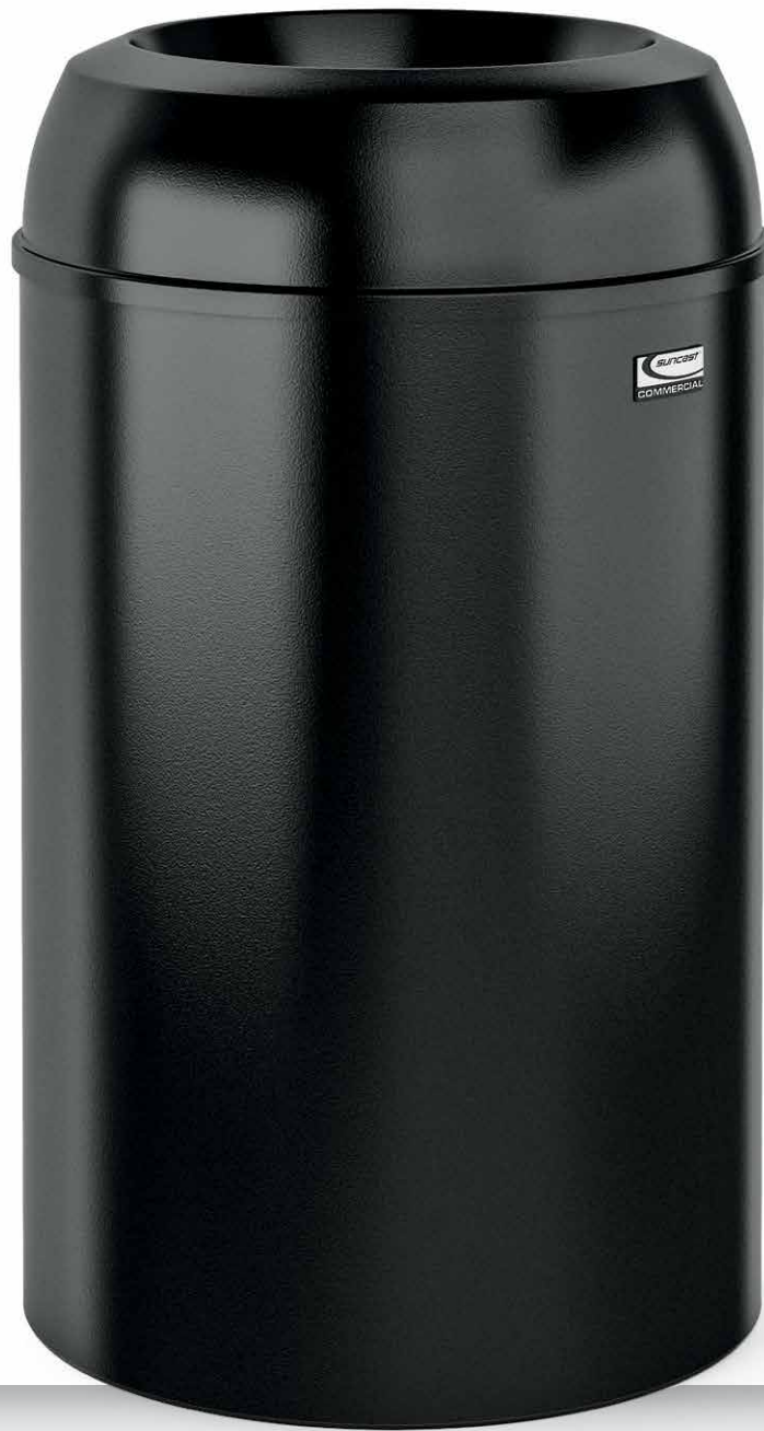
MTCIND3001 model shown

TEXTURED POWDER-COATED BODY Maintains a professional appearance