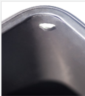
Step 1: Locate slot opening in corner