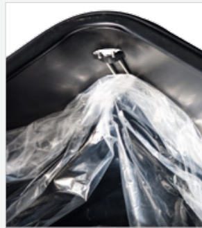
Step 4: Secure bag over J hook