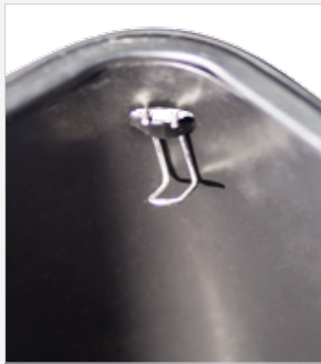
Step 3: "J" portion of hook should point to center